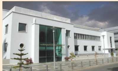
The House of Representatives

The Government of Cyprus has declared consistently and in every way possible, its determination to proceed with a functional and viable compromise that will address the legitimate concerns of all the