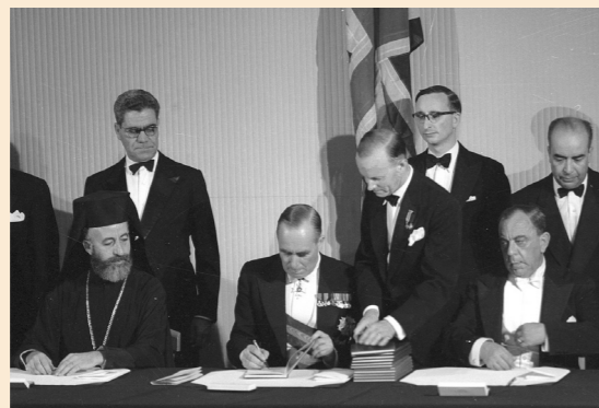
Official ceremony of the establishment of the Republic of Cyprus on 16 August 1960, in the House of Representatives in Nicosia. The last British Governor Sir Hugh Foot (centre) transfers power to President Makarios in the presence of the Vice-President Dr Fazil Kutchuk

Despite the shortcomings of the imposed constitution, and an independence under guardianship, that were provided by the Zurich and London agreements, the establishment of the Republic of Cyprus is nevertheless a great historical achievement, which created legitimate expectations paving the way towards progress for Cyprus and its people.