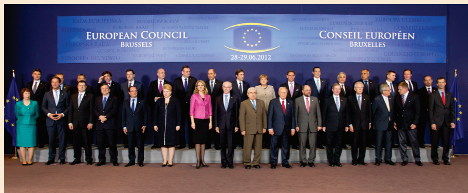
The President of the Republic of Cyprus at the 2012 European Council Meeting in Brussels

The Greek Cypriot community strives towards reconciliation and cooperation with the Turkish Cypriot community in order to build a peaceful and happy future. Learning from history and leaving behind the mistakes and the traumatic experiences of the past, it is ready to walk, together with the Turkish Cypriots, along the path of reunification, peace and prosperity.