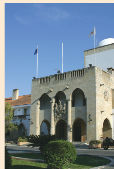
The Presidential Palace

This development was the first population segregation of the people of Cyprus. The criminal and treacherous coup against the legitimate President of the Republic, on 15 July 1974, gave a long-sought pretext for Turkey to invade Cyprus in order to implement its partitionist plans. The invasion of Cyprus by Turkey, on 20 July 1974, is undoubtedly the most dark and tragic chapter in the turbulent history of Cyprus. The blow was heavy and the human suffering indescribable: About 37% of the sovereign territory of the Republic of Cyprus was occupied by Turkey's troops; one third of the population was forcibly expelled from their homes and properties and became refugees in their very own country; thousands of people were killed while hundreds of families are still waiting for the ascertainment of the fate of their loved ones who have been missing since then.